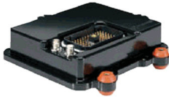
QUALCOMM GlobalTRACS Hardware

The machine-hour meter data integrates with PFW IntelliDealer's Service Agreements by providing the equipment inventory in PFW IntelliDealer with updated hour meter readings, so service contracts that are based on machine hours can be managed easily within the PFW IntelliDealer system. The updated machine hour data will work with the preventative maintenance program in order to promptly service the equipment. Machine hour data can be calculated into average daily usage as well, in order to determine when the machine is nearing a scheduled service.