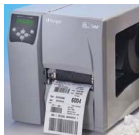
Note: Currently, the S4M is the only model supported by PFW IntelliDealer

At the heart of IntelliDealer's Label Printing Solution is the Zebra S4M direct thermal/thermal transfer printer. Constructed of metal, the Zebra S4M is suited to the harsh dealership environment. This label printer can print up to 6" (152mm) of the label roll per second, which means less time waiting for your labels and more time applying them.